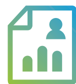
User Oriented Report Designer