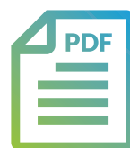
Report in Word, Excel, PDF, CSV