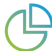
Chart options: bar, pie, line, stacked bar